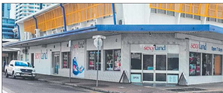
The Sexyland Darwin store is open every day until Christmas

Sexyland stores offer elegantly presented retail spaces with atmospheric downlighting, friendly uniformed staff and exciting products from all over the world.