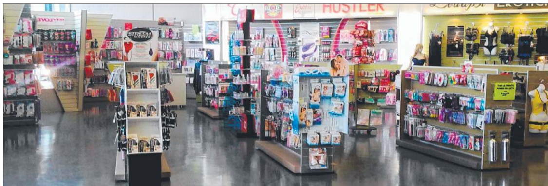
Sexyland stores offer elegantly presented retail spaces, with friendly uniformed staff and exciting products

They are in Stuart Park, Palmerston and Smith Street, Darwin.