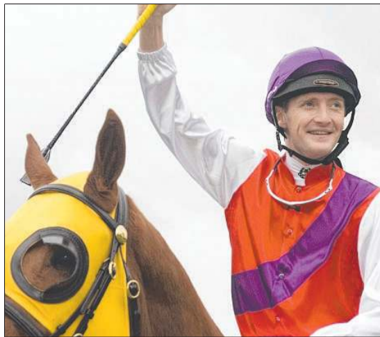
Stephen Curry (as Damien Oliver) in a scene from film The Cup

adequately tells an entertaining part of our sporting history. With lesser actors it may have descended into straight-to-DVD melodrama, but the talent here keeps this horse running to the finish line.